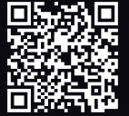
RUTX50 360° VIEW